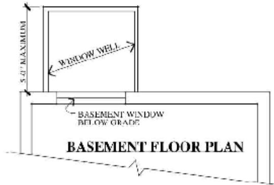
ILLUSTRATION E (BUILDING HEIGHT/FINISH GRADE-WINDOW WELLS)